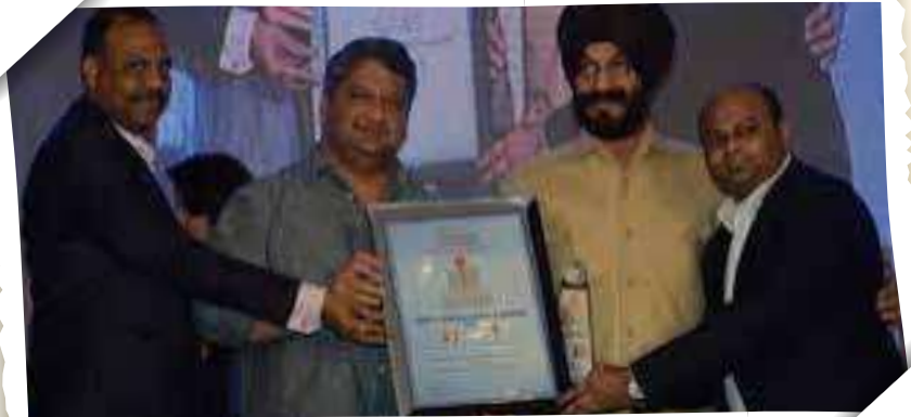
FASTEST DEVELOPING PROJECT IN TAMIL NADU (2015)