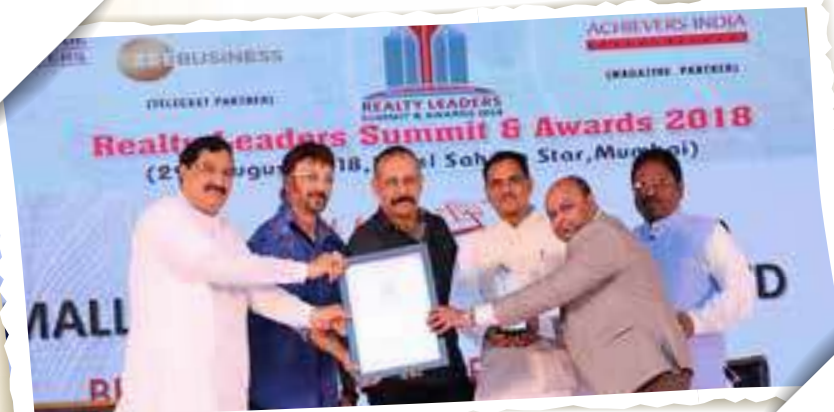
BEST AFFORDABLE RESIDENTIAL DEVELOPER IN TAMIL NADU AWARD (2018)