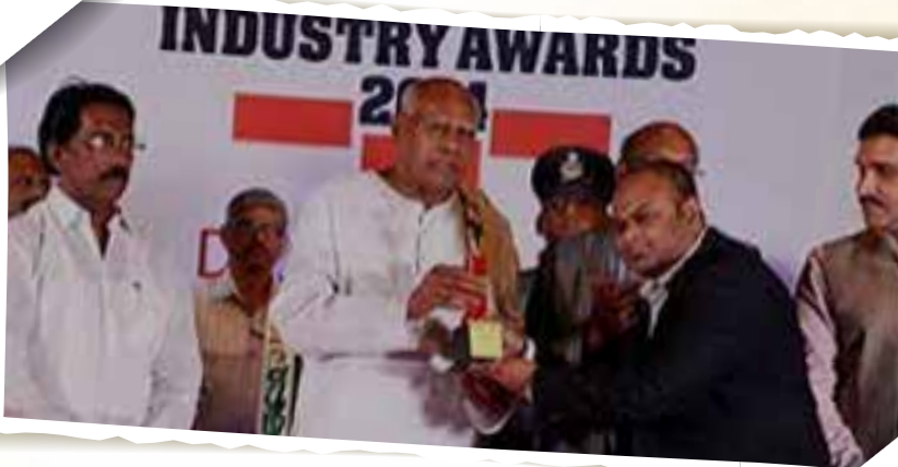
KATTUMANA THOZHIL (2014)