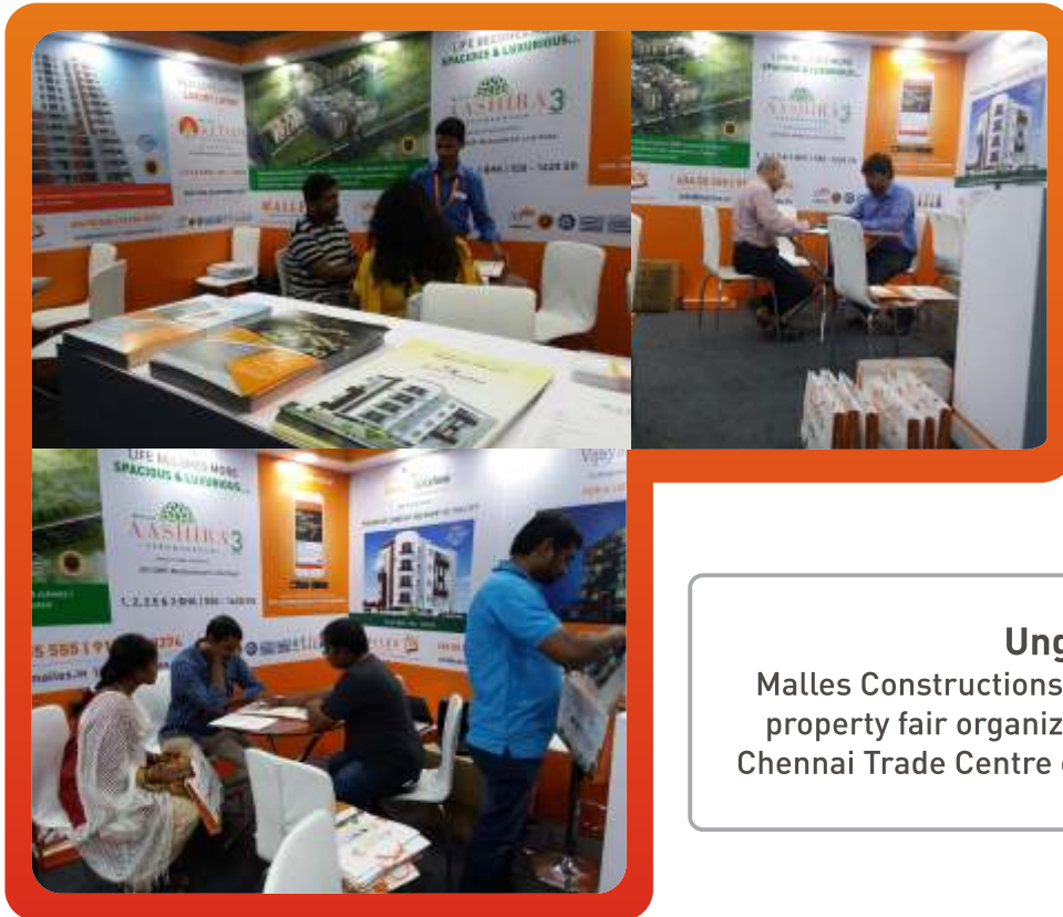
Ungal Illam 2015 Malles Constructions participated in Ungal Illam mega property fair organized by LIC Housing Finance at the Chennai Trade Centre on 12th and 13th September, 2015.