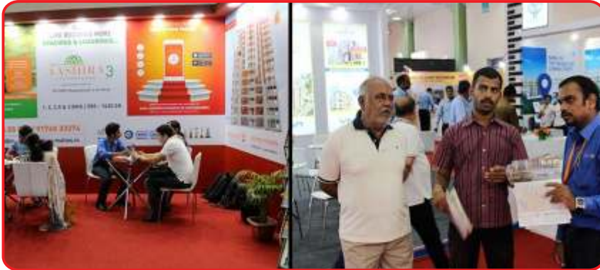
Times Property Fair 2015 Malles Constructions participated in the grand Times Property Fair at the Chennai Trade Centre on 3rd & 4th Oct, 2015.